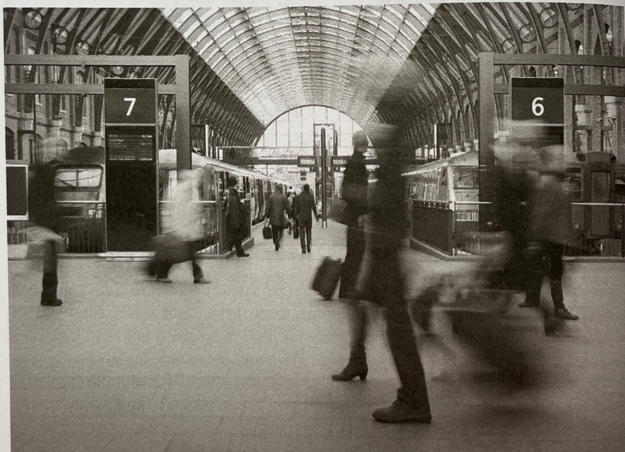
Abb. 21 Sich am Bahnhof zurechtfinden