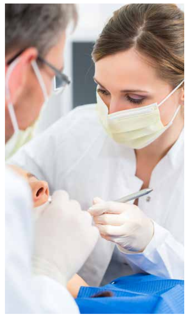
Health insurance in Germany also covers treatment at the dentist's.

Medications in Germany are only available from pharmacies. For some medications, you will need a doctor's prescription.