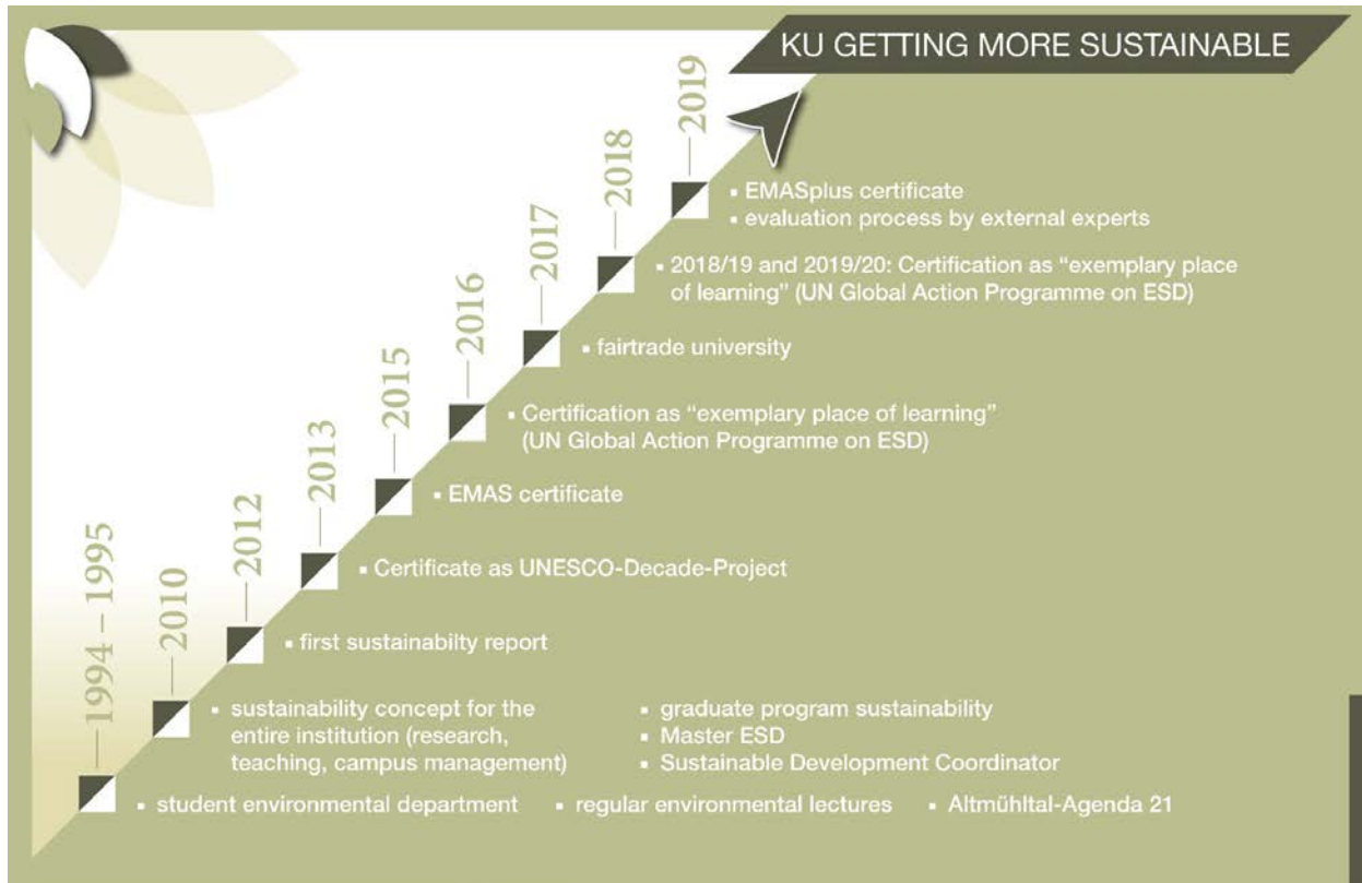
Fig. 2: Sustainability developments at the KU (C. Pietsch).