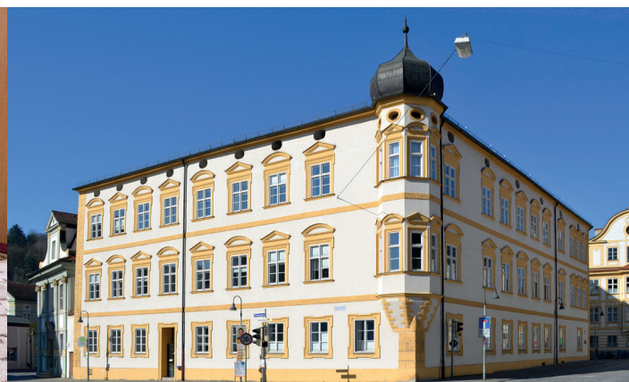
Last updated: Febr 2021