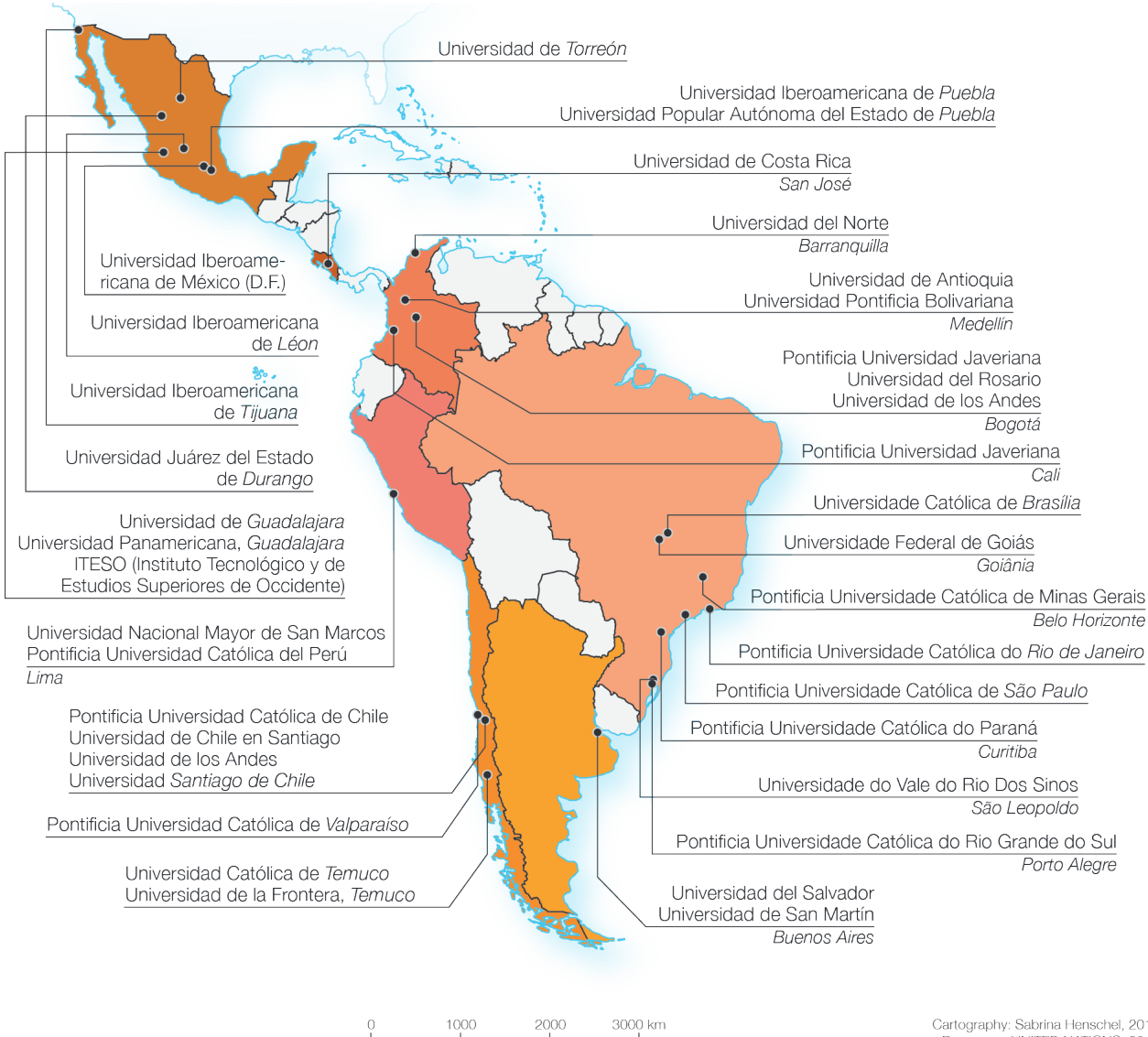
Cartography: Sabrina Henschel, 2016 Base map: UNITED NATIONS, 2011 Last updated 2019

More than 35 agreements with universities in Latin America, as well as our numerous contacts and collaborations in the area enable close international research cooperation. These ties are reflected in a variety of ways, such as in the exchange of students and lecturers, joint publications, and collaborative research projects.