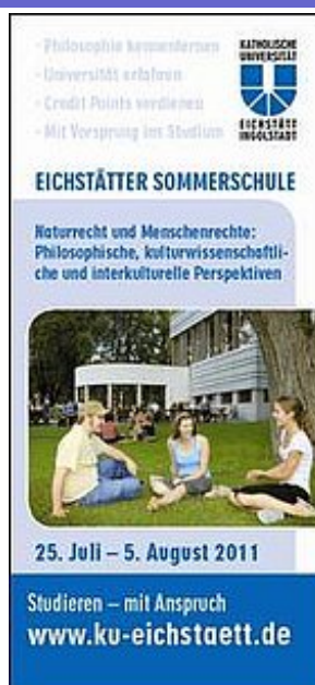
Summer School 2011