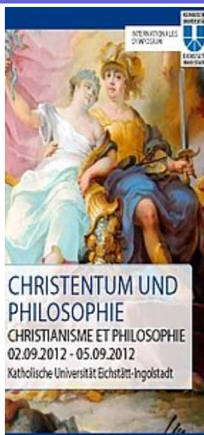
Christianity & Philosophy 2012