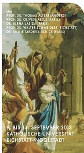
Master Class 2013

MIT PROF. DR. JEAN-LUC MARION (PARIS/CHICAGO)